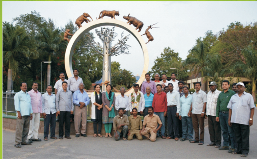
Please see page no. 43