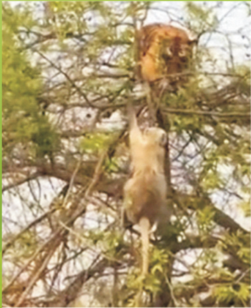
Please see page no. 44