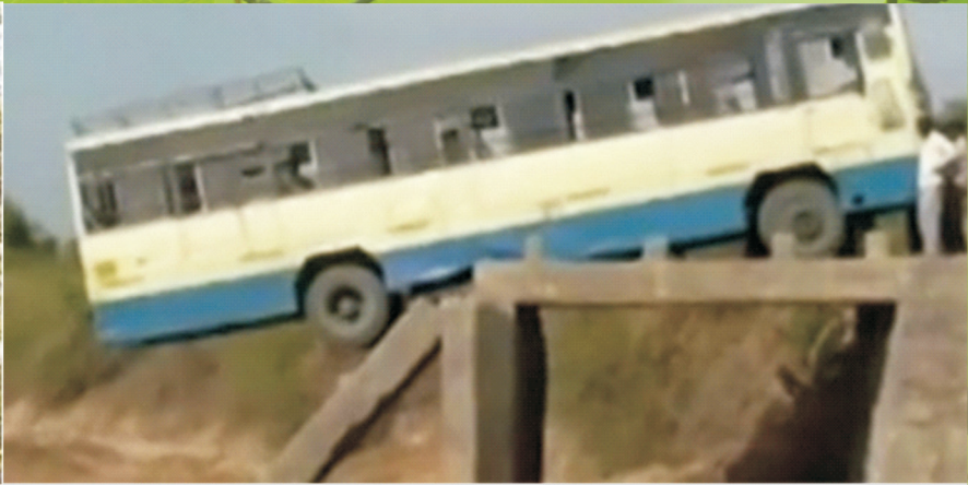
Please see page no. 45